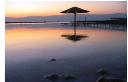
Sunrise Over the Dead-Sea

Masada , is, aside from the Dead Sea itself, the great attraction of the area. Atop a mountain to the side of the Sea lies this ancient fortress. With a steep history and ascent, Masada is a UNESCO World Heritage Site and is traditionally climbed early in the morning by tourists wishing to see the ruins at the top as the sun rises over the Dead Sea and mountains of Jordan in the distance. Today it is not necessary to climb, as a cable car has been built