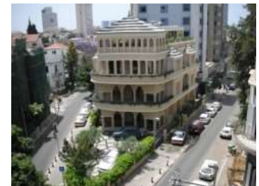
Tel Aviv's 'White City' is a UNESCO World