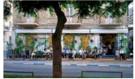
Tel Aviv street scene.

Tel Aviv is also a great starting point for exploring the region, with easy access to the highlights of Israel (Jerusalem, Dead Sea, Masada, Galilee) and beyond (Eilat, Petra, Wadi Rum) within a one-day trip. Tours starting from Tel Aviv are often the most convenient and cost-effective way to travel.