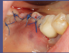
Soft tissue closure