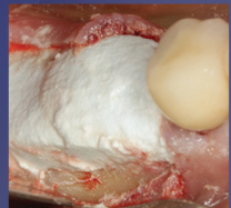
Bond Apatite in place (one minute application time)