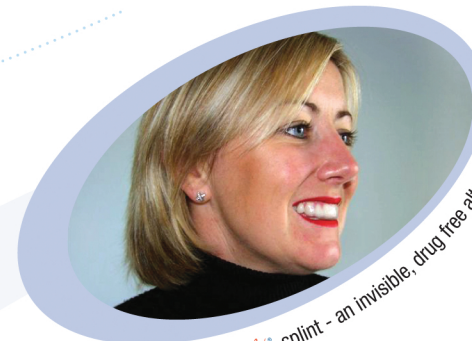
Patient wearing a BiteSoft® splint - an invisible, drug free alternative