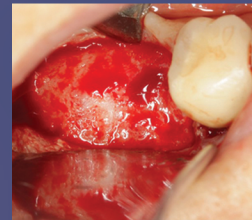
Bone formation 3 months post-op

Call Caitlin Todd at 1-800-354-2075 x 7138 to register and secure seating!