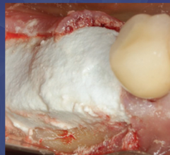
Bond Apatite in place (one minute application time)